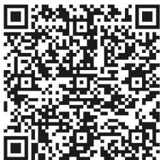
Transitions® Signature® GEN 8™ Kit