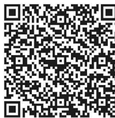
Transitions® XTRActive® new generation Kit