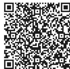
Transitions® Light Sensitivity Test